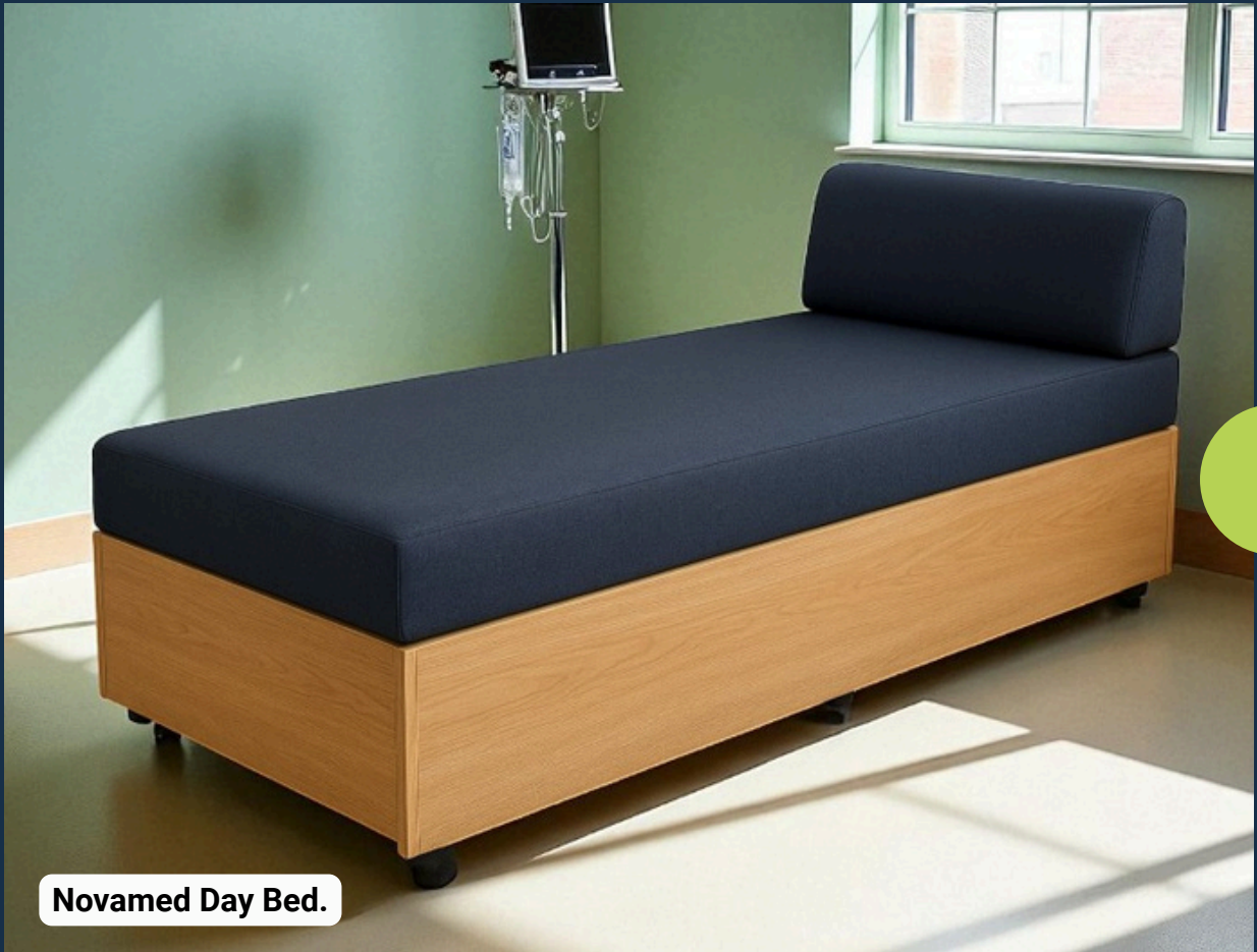
Novamed Day Bed.