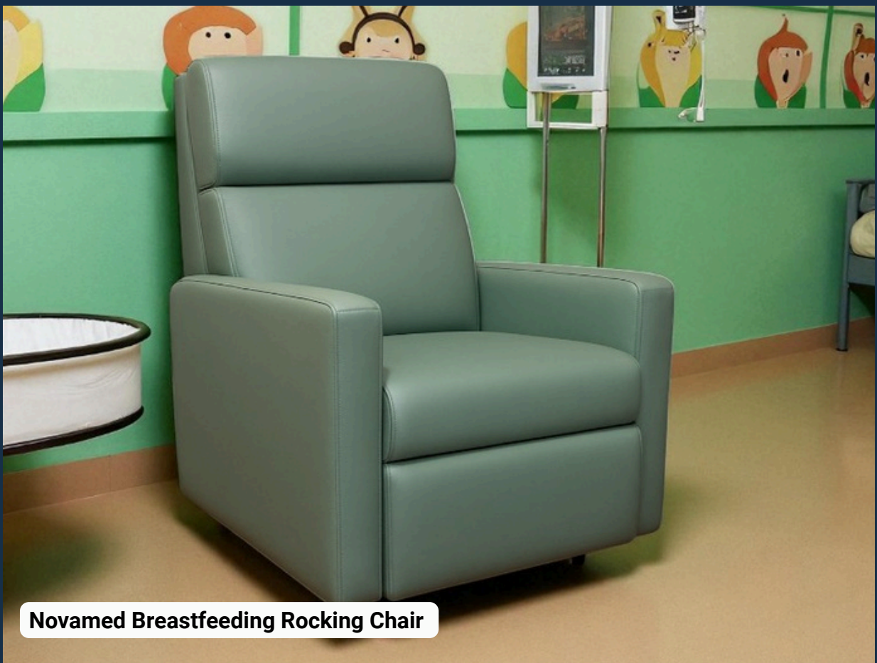
Novamed Breastfeeding Rocking Chair